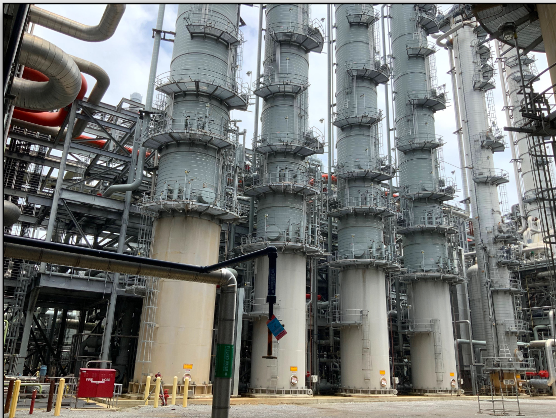
Selexol Flow Schemes Sulfur Removal & CO 2 Capture—Conventional

EACH LINE CAN PROCESS ABOUT 536 MMSCFD OF SYNGAS TO REMOVE CO2 FROM 22.37 MOLE% DOWN TO ~0.5 MOLE% AND 3130 PPM H2S DOWN TO <5 PPMV. NORMAL OPERATING CAPACITY ~509 MMSCFD PER LINE.