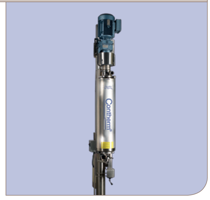
Contherm SSHE model 6x6

Product enters the cylinder through the lower product head and flows upwards through the cylinder. At the same time, the heating/cooling media travels in counter-current flow through the narrow annular channel between the heat transfer wall and the insulated jacket.